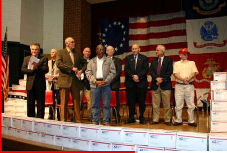
Eight Veterans received diplomas this year.

The Milford School District is continuing a new tradition, initiated in 2008, to pay tribute to veterans from the community and say thank you to local men and women serving overseas. The district held a special event at Milford High School on Sunday, November 8. The Veterans Day Celebration recognized the service and sacrifices of all veterans from the Milford area and surround-